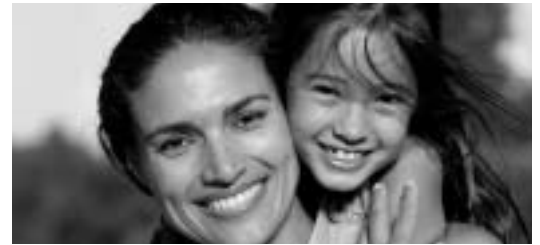
Someone like Amber wants a health insurance plan that provides her family a wider range of benefits. She may prefer the lower deductibles and lower out-of-pocket costs of SignatureOptions (PPO).