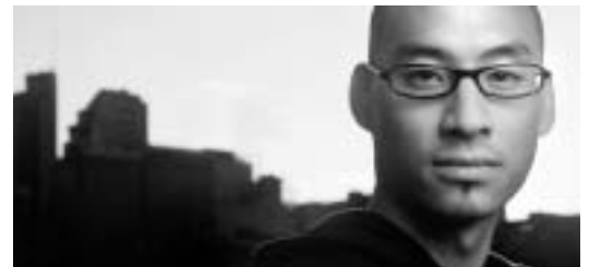
Someone like Peter is looking for a plan where he doesn’t have to pay for benefits he may not use. He would still like coverage should he be in an accident or is affected by a medical condition. Peter may find the benefits with SignatureOptions (HDHP) a good fit for his health insurance needs.